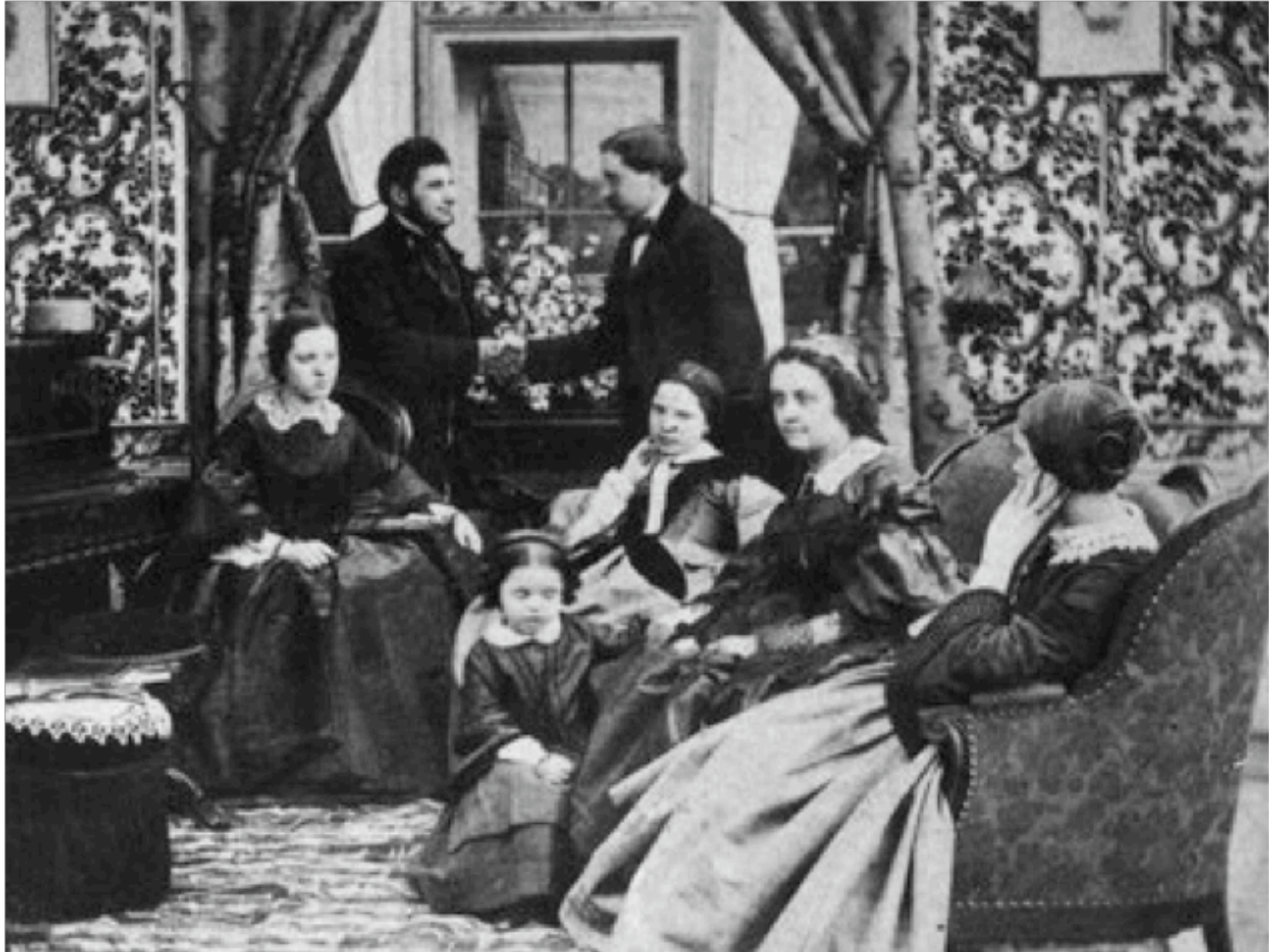
A Victorian family circa 1860

If you're like many Americans, you have just spent a few days in close quarters with your parents, grandchildren, siblings, etc. You're ready to go home, or ready for them to go home. But for a growing number of families in which adult children can't afford to live on their own, this is the new normal.